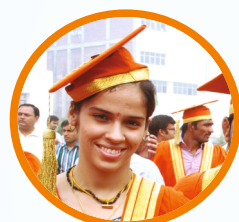
Ms. Saina Nehwal Badminton Player Recipients of Honoris Causa, 4th Convocation