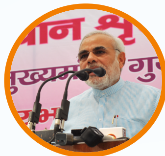
Shri Narendra Modi Hon'ble Prime Minister of India on National Lecture Series "Naxalite Problem in India"