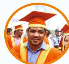
Shri Sushil Kumar Wrestler Recipients of Honoris Causa, 4th Convocation