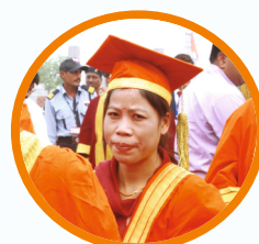
Mrs. Mary Kom Boxer Recipients of Honoris Causa, 4th Convocation