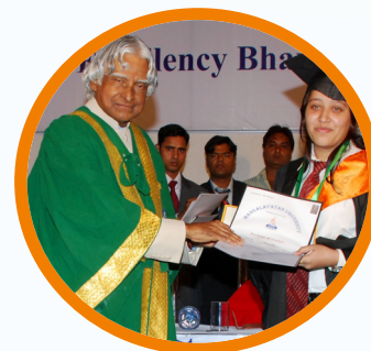
Shri A.P.J. Abdul Kalam Former President of India Chief Guest, 2nd Convocation